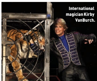
International magician Kirby VanBurch.

The shortest name of any Branson attraction belies the show's over-the-top production; "it" brings together 50 world-class singers, dancers and musicians to create one of the city's signature entertainment experiences. The award-winning cast includes the famous Hughes Brothers and their families, backed by huge production numbers running the gamut of Broadway, country, comedy, patriotic, gospel and rock and roll. The location of "it" inside the Hughes Brothers Theatre on Highway 76 epitomizes the Branson experience; visit itbranson.com for show times and tickets.