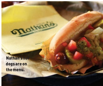
Nathan's hot dogs are on the menu.