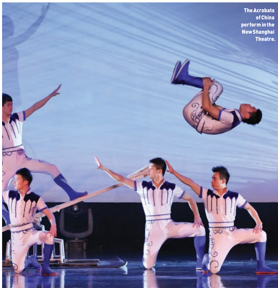
The Acrobats of China perform in the New Shanghai Theatre.