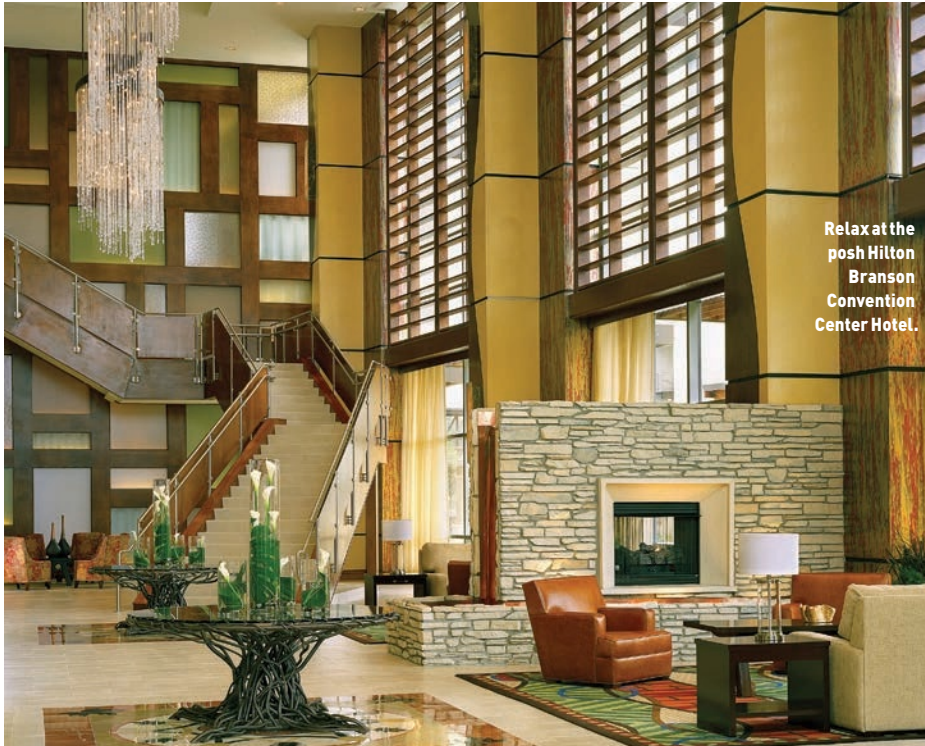
Relax at the posh Hilton Branson Convention Center Hotel.

state-of-the-art lighting and mesmerizing physical feats for thrilling, twice-a-day performances. For tickets, visit acrobatsofchina.com .