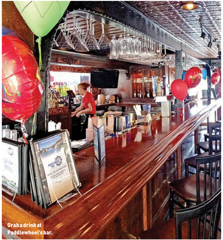
Grab a drink at Paddlewheel's bar.

Moonshine is an integral part of Ozark folklore, and you can sample some of the best at The Paddlewheel, one of Branson's latest and greatest new restaurants. An actual 1960s-era paddlewheel riverboat is the setting for the restaurant and bar, which is located on the water at Branson Landing; it previously cruised the White River (now Lake Taneycomo) but was permanently docked and renovated in April. The Paddlewheel is one of the only places in town where you can eat and drink right on the water, a welcome respite from summer heat thanks to the clear, cold waters from Lake Taneycomo. Adults will enjoy adding locally distilled Copper Run