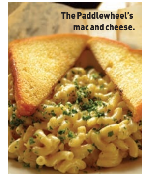
The Paddlewheel's mac and cheese.

moonshine to any beverage on the menu, while younger family members can down something off the Nathan's Famous menu, featuring variations on Nathan's signature hot dogs and popular menu items like the gouda-and-parmesan macaroni and cheese. The restaurant's large patio affords a prime view of the Branson Landing Fountains and its fire, water, light and music show, making it a popular spot to grab a seat with the family in between hitting the area's shopping and entertainment options. Visit mainstreetlakecruises.com for more.