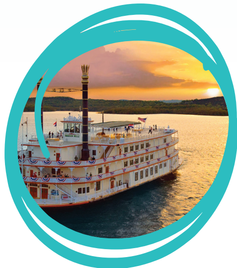
Table Rock Lake is Branson's biggest lake for recreation. It is a gigantic warm water lake where you'll find lots of boats, Moonshine Beach for swimming, great walking and hiking trails, and other fun attractions! Cars can drive over Table Rock Dam where the water of Table Rock Lake goes into Lake Taneycomo.