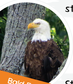
Bald Eagle on Lake Taneycomo

Heavy Metal High Rise at the Track Family Fun Parks , towers four stories above the Branson Strip!