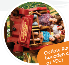
Outlaw Run (wooden coaster at SDC)

Polar, the Titanic Bear , a stuffed bear at the Titanic Museum Attraction , is based on an actual toy bear owned by one of the 133 children who sailed on the Titanic.