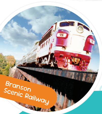
Branson Scenic Railway

You'll hear the sounds of a big band at the show SIX , but there are no musical instruments in the show. All those sounds are made by the voices of the 6 brothers!